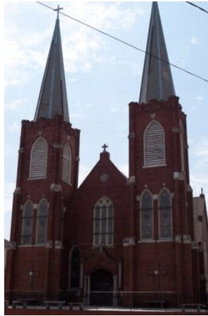
St. Anne Church