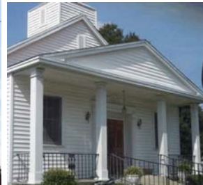
St. Jude Church