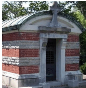
Ella Tuomey Mausoleum