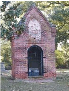
Natalie Delage Sumter Chapel